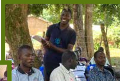
Training in Kitgum