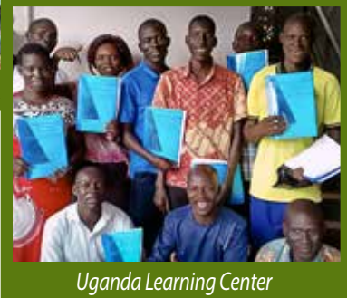
Uganda Learning Center