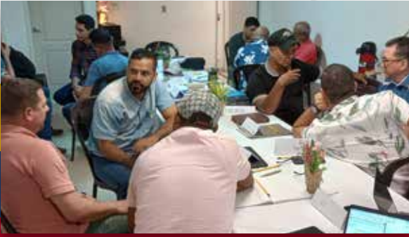
Training in Colombia