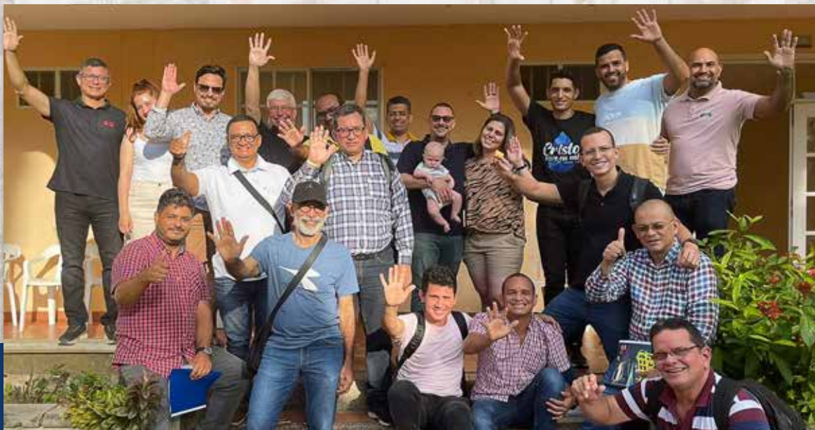
Students from Cartagena and Medellin

Iglesia Gracia Abundante in Cartagena Director of City to City Colombia