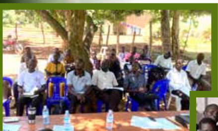
Thirdmill Institute Group at Kitgum