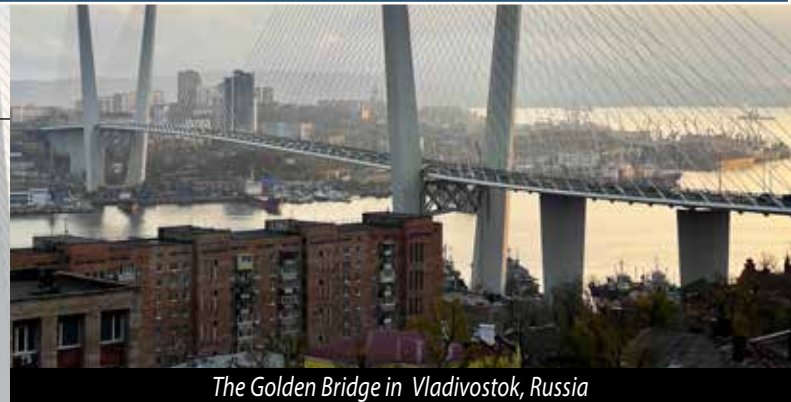
The Golden Bridge in Vladivostok, Russia