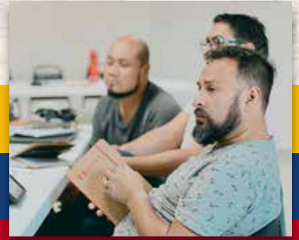
City to City meeting